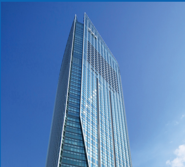
Tokyo Head Office (Toranomon Hills Mori Tower)

Our key offerings include: trust services, outsourcing, global custody, offshore fund services, portfolio solutions, financing solutions, GlobalLINK™, State Street Alpha, and securities agency services.