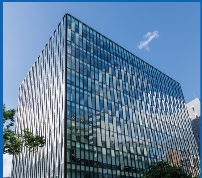
Fukuoka office (Hakata FD Business Center)