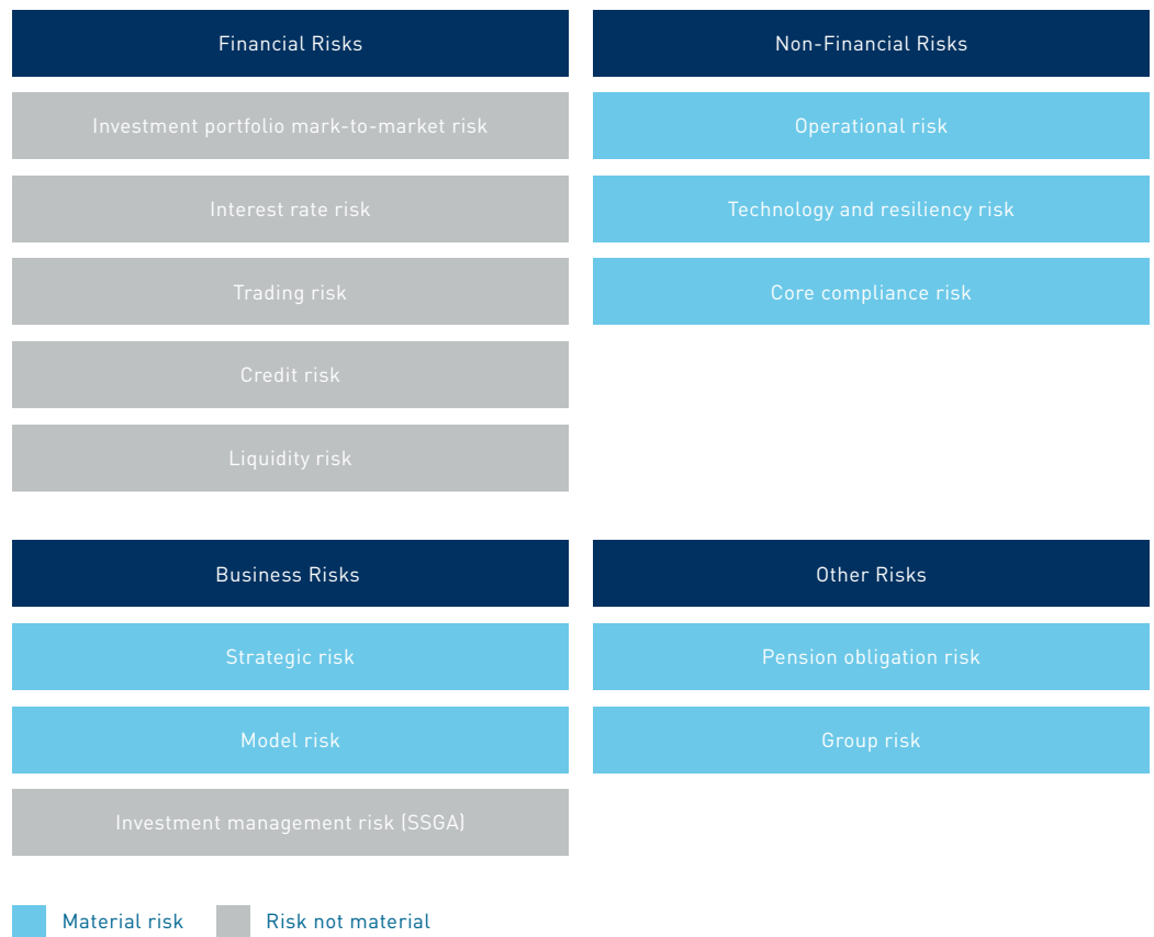
Figure 3: Risk Taxonomy

The ICARA is used to evaluate SSGMIL’s capital and liquid asset resources in relation to its capital and liquidity requirements on a forward-looking basis examining how SSGMIL identifies and manages the material risks and harms that it accepts in the execution of its strategic objectives. The ICARA includes SSGMIL’s approach to determine appropriate levels of internal capital and liquidity requirements over the projected period.